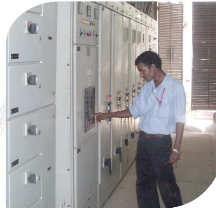
Piramal Healthcare Ltd.