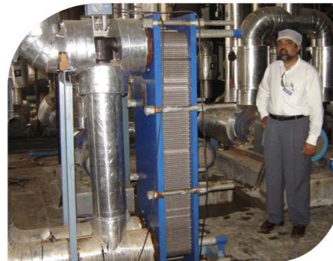
Essel Propack (Wada)

For HVAC & process cooling system, we supply & install AHUs, Heat Exchangers, Chillers, Pumping Stations, Cooling Towers, Ducts, Piping and Insulation.