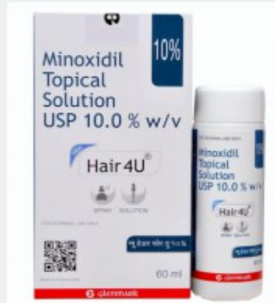
Rogaine (10%) Generic 60ml Bottle