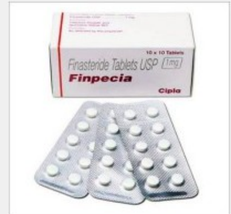
Propecia 1mg Tablets (Generic Equivalent)