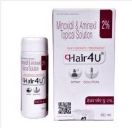
Minoxidil (2%) + Aminexil (1.5%) Generic 60ml Bottle

Minoxidil (2 %) + Aminexil (1.5 %) Bottle